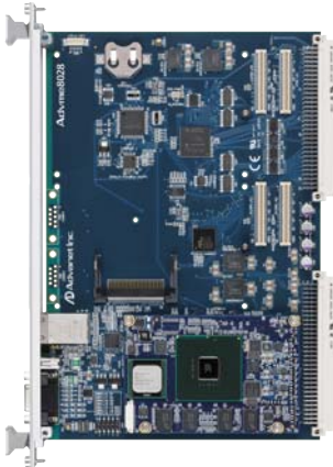
*CompactFlash is not included